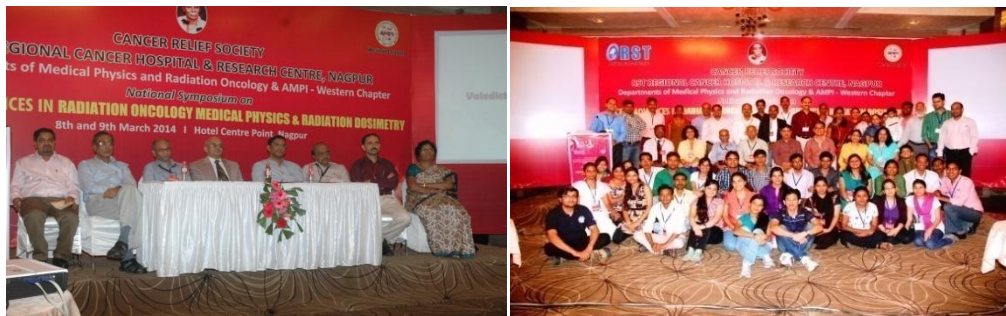
Last Valedictory Programme on 9 th march