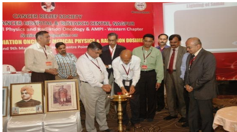
8 th March 2014 (Saturday) Auspicious beginning lighting the lamp

Medical Physics specialty play very crucial role in designing effective radiotherapy planning. In addition to this, radiation safety and protection of patients, radiation workers and community. Teaching and training awareness about Radiation in Medical Application are also a part of this profession. An effective and optimum use of radiation and awareness amongst community is also a vital issue for its promotion.