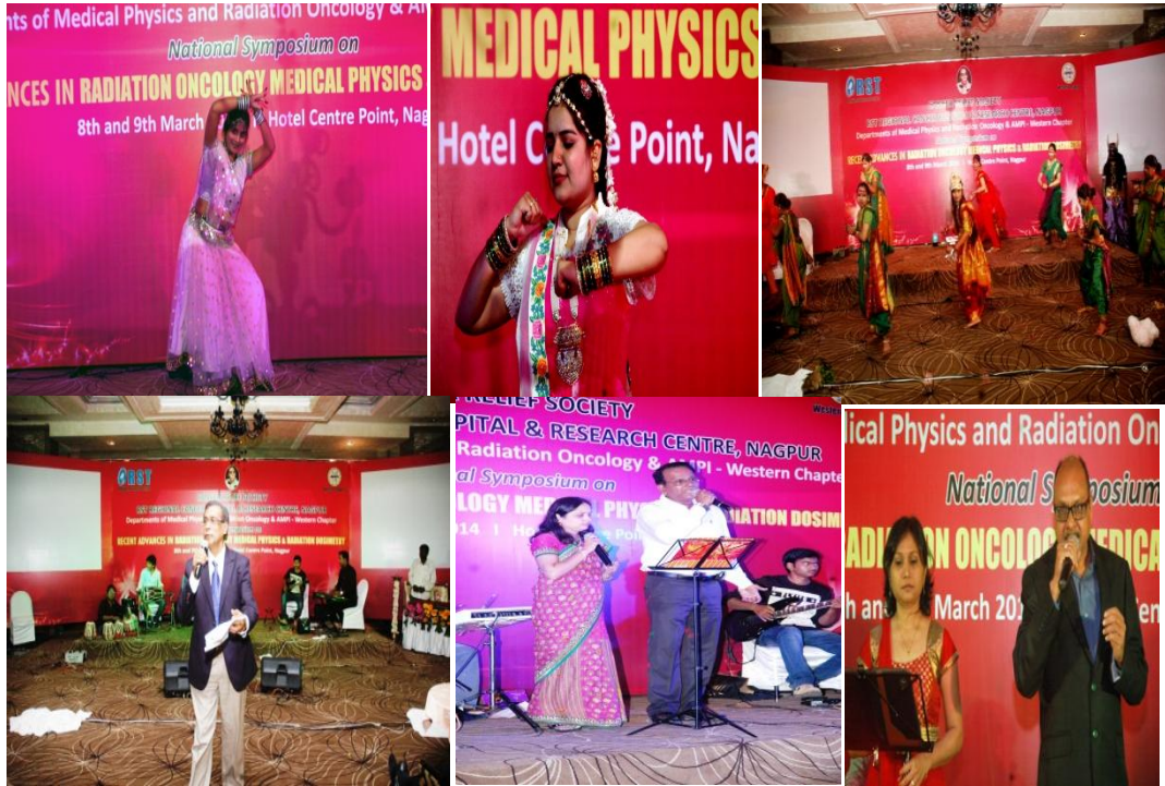
Various Dance and Musical Programme