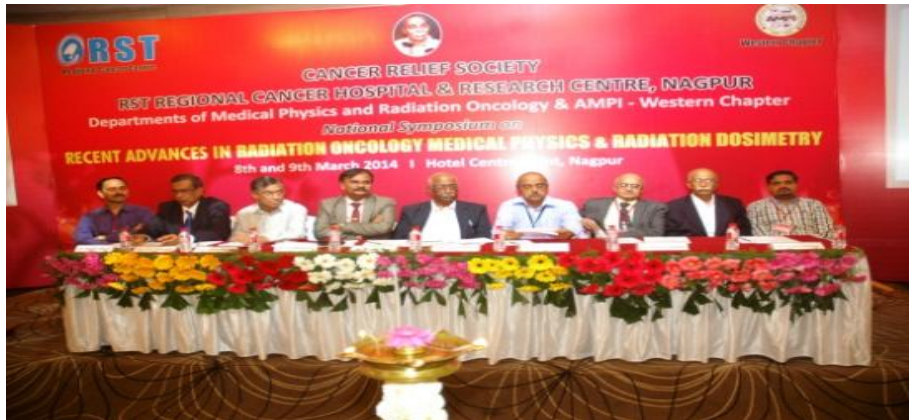
Inauguration of Cultural Programme on 8 th March 2014 Evening

There are a special Panel Discussion Session on Radiation Source Safety and Security and related current practices, which are of great concerns not only to organization but also for threat reduction challenges to be taken on for public protection in case of incidence.